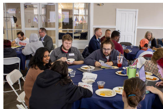
Photo from "Democracy Dialog" event at New England College