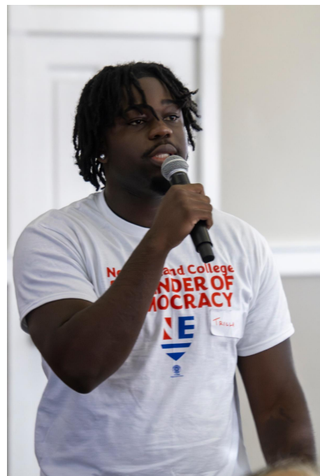
Photo from "Democracy Dialog" event at New England College