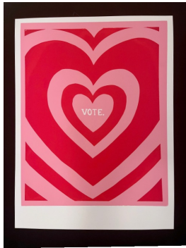
Vote Poster , Sadie Chow, Silkscreen (Edition of 14), 2024

political context. How would they use design elements to make voting attractive to fellow students? How would they make a national election feel personal to the Ursinus community?