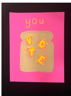
You Butter Vote , Bridget Wappman, Silkscreen (Edition of 14), 2024

In the runup to the 2024 Election, Ursinus College was home to a unique Get Out the Vote effort. Alongside the political fliers and campaign posters, Ursinus’s campus was also decorated with colorful screen-printed posters - a limited-edition run of designs created by students to urge their peers to cast their ballots.